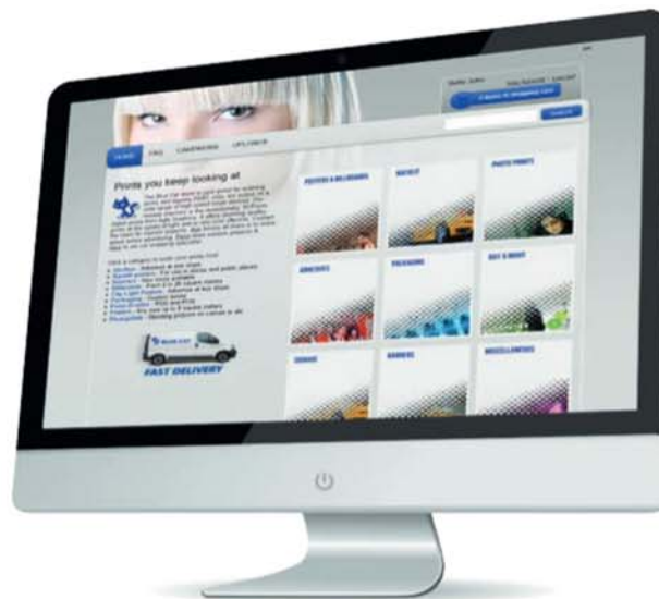
Asanti StoreFront web-to-print software

Asanti StoreFront, a comprehensive web-to-print service, is designed to handle incoming orders from the internet. Automated payment processing and error-free print preparation ensure new jobs are ready for printing in no time and with a minimum of operator intervention.